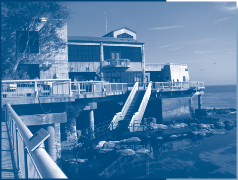
The Monterey Bay Aquarium is renowned for more than its inhabitants; it's a marvelous feast for the architectural aficionado as well.

To propose a presentation or session, please email a 100-200 word abstract of your proposal to ccphprogram@hotmail.com . Include your name and the names of any other presenters, your affiliation(s), and contact information including mail and e-mail addresses, and phone numbers. Please also indicate any audio-visual needs. The deadline for proposals is April 30, 2009. Early submission is appreciated. ■